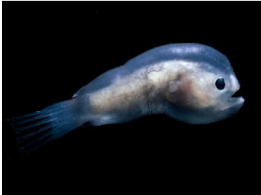
Male Angler Fish