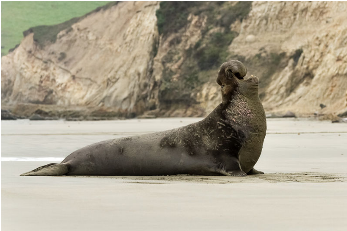
Elephant seals dive to extraordinary depths.

The sperm whale, seen in the diagram above, is the diving champion of marine mammals. Sperm whales can stay under water for over 90 minutes and dive to depths of nearly 10,000 ft. It has an extraordinary array of adaptations that allow it to dive so deep. All marine mammals can make dives that are deep compared to human beings. Here is how they do it.