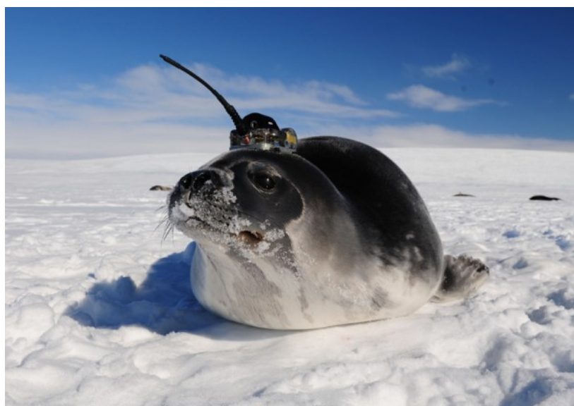
A Weddell seal is shown wearing a Sea Mammal Research Unit Conductivity Temperature Depth tag in McMurdo Sound Antarctic.

When exercising, we say that when humans have run out of oxygen they have gone anaerobic. This means that muscle cells do not have sufficient oxygen to break sugar apart through aerobic respiration. This is very taxing on muscles and leads to soreness and fatigue. In marine mammals, most body organs appear to switch to anaerobic respiration while diving without suffering the same ill effects. We still don't know exactly how they do this.